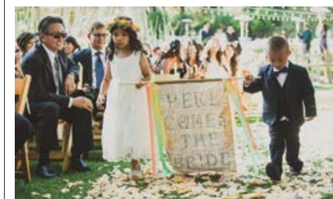
CLOCKWISE FROM TOP LEFT: 'Maids and 'men at Martin Johnson House. Vows at La Valencia. Driving down the 101. Aisle style at Temecula Creek Inn. Young at heart in the New Children's Museum. Sitting a spell at Big Daddy's Antiques. PREVIOUS PAGE: Sunnies, Santa Monica, sandals, smooches, sweets, Santa Barbara, sprigs and smiles.